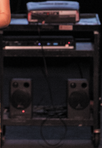
2016 AIDS Benefit