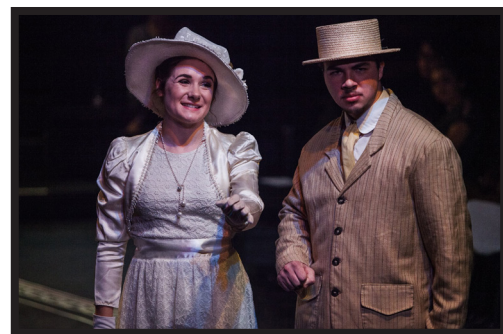
A Little Night Music, 2016

The Academy is accredited by the Independent Schools Association of the Central States (ISACS) and is a member in good standing of the National Association of Independent Schools (NAIS). The Academy is recognized by the Illinois State Board of Education (ISBE) and is a member of the Illinois High School Association (ISHA) and the Arts School Network (ASN).