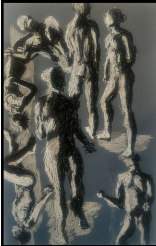
Figure Drawing Exhibition