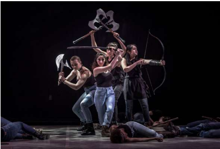
She Kills Monsters Preview, Showcase 2017