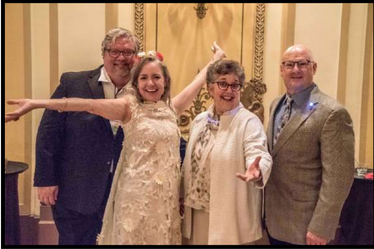
2017 Gala Co-Chairs