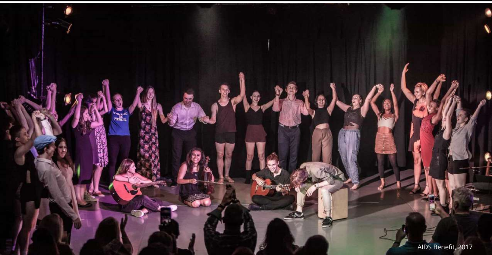
AIDS Benefit, 2017