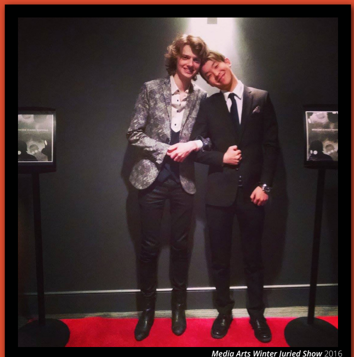
Media Arts Winter Juried Show 2016